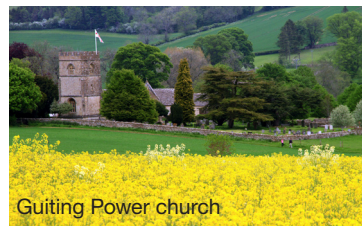
Guiting Power church

Go through the gate and continue straight ahead through the field, following the contour line to a gate. Continue in the same direction across the next field to the corner of a copse. Keeping the copse on your left follow the path through a gate to the road. Turn right downhill along the road and go straight across the T-junction to a gate opposite. Go through the gate and continue straight ahead across the field towards the church in the distance, to meet another gate. Go through and down the steps over the bridge and up past a redundant gate. Head straight across the next field to a gate then follow the wall to meet a gate by St Michael's and All Angels Church and the village toilet. Keep straight ahead along the lane past the village hall and deli into Guiting Power 5.