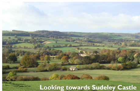
Looking towards Sudeley Castle

turn left through a gate C and continue walking uphill beside the fence on your left to a plantation of trees. Go through two gates and the path bears right. Keep straight on towards the field boundary ahead. Keeping the boundary on your left proceed to a gate. (At this point avoid following the farm track bearing right towards a gate to leave the route). Follow the way markers to the gate, continue beside the pen, sometimes containing Gloucester Old Spot pigs to another gate at the far end of the pen. The path turns left up a track to a field gate with a gate on the left hand side. D Enter the