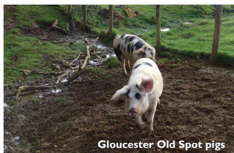
Gloucester Old Spot pigs

turn left through a gate C and continue walking uphill beside the fence on your left to a plantation of trees. Go through two gates and the path bears right. Keep straight on towards the field boundary ahead. Keeping the boundary on your left proceed to a gate. (At this point avoid following the farm track bearing right towards a gate to leave the route). Follow the way markers to the gate, continue beside the pen, sometimes containing Gloucester Old Spot pigs to another gate at the far end of the pen. The path turns left up a track to a field gate with a gate on the left hand side. D Enter the