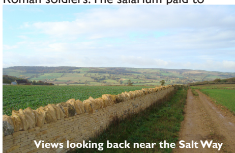
Views looking back near the Salt Way