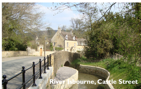
River Isbourne, Castle Street

Follow the path diagonally across the meadow to the far left hand side, notice the ridge and furrows resulting from ploughing in the Middle Ages, 100's of years ago. The land has not been ploughed since.