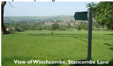
View of Winchcombe, Stancombe Lane

After 100 metres bear left at a sharp bend B into Stancombe Lane and follow uphill for approx 400 metres until you meet a footpath on your right C .