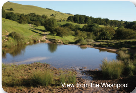
View from the Washpool

you reach a metalled lane D , continue straight on over a stile following the Isbourne Way and follow the (sometimes muddy) path alongside the river and the buildings of Postlip Hall on your left, partially hidden by trees.