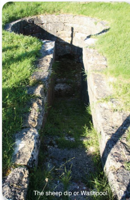
The sheep dip or Washpool

The Washpool was fed with water from the pond immediately above it, formed by damming the stream that flows down from a spring about 200 metres up the valley which is known, appropriately, as 'Watery Bottom'.