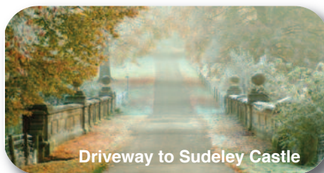
Driveway to Sudeley Castle

Cottage, taking in the views across the valley to Winchcombe.